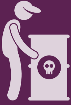
Exposure to certain chemicals