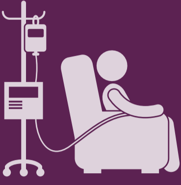
Past chemotherapy or radiation treatment