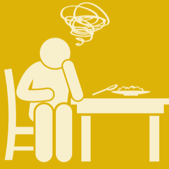
Loss of appetite