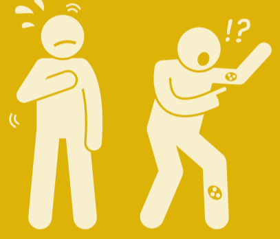
Individuals may also experience symptoms of anemia, frequent infections and easy bruising/bleeding

After a confirmed diagnosis, which can include a medical exam, blood tests and a bone marrow biopsy, treatment usually begins immediately. 5 This can present challenges for patients and their families.