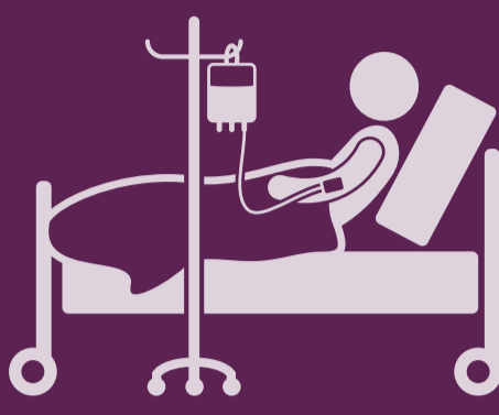
History of blood disorders or childhood cancers