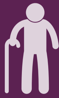
Older age (median age 68) 3