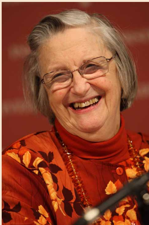
Elinor Ostrom (7 August 1933 – 12 June 2012)

We dedicate this report to the memory of Elinor Ostrom, Professor of Political Science at Indiana University and Nobel Laureate in Economics. Her work provided a fundamental contribution to the understanding of collective action, trust, and cooperation in the management of common pool resources, including the atmosphere. She launched a research agenda that has encouraged scientists to explore how a variety of overlapping policies at city, national, regional, and international levels can enable humankind to manage the climate problem. The assessment of climate change mitigation across different levels of governance, sectors and regions has been a new focus of the Working Group III contribution to AR5. We have benefited greatly from the vision and intellectual leadership of Elinor Ostrom.