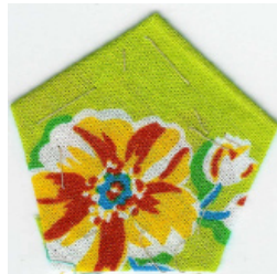
First patch tucked!

When you have 12 paper pieces covered with fabric you sew all of these together too. You start with one piece that goes in the middle, and then sew the bottom edge of five other pieces to that. Make sure your stitches are on the back -/paper side. You make 2 "flowers" as shown on the photo. Next sew the flower together into a "bowl" and last sew these two bowls together leaving only one seam un-sewn.