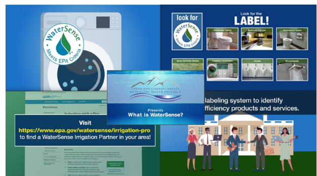
“What is WaterSense” video.

The Upper District pivoted its Conserve-a-palooza event into a five-week virtual campaign to celebrate its 60th anniversary during the pandemic. The campaign featured weekly water efficiency quizzes and raffles for various prizes, including WaterSense labeled weather-based irrigation controllers. Winners were announced weekly and water-saving tips were shared during a “Water Smart Minute” video on Upper District’s website and social media. The Upper District also conducted six live landscape webinars for 150 participants; speakers discussed WaterSense labeled products and how to find an irrigation professional. To reach younger residents, the