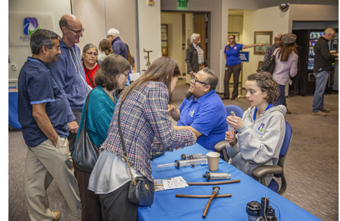
IRWD Fix a Leak Week workshop.

The District's Home Water Check-Up and Commercial, Industrial and Institutional Site Evaluation programs completed more than 175 in-person leak-check visits and tele-visits in 2020. During the pandemic, IRWD staff modified WaterSense's Landscape Checklist to help customers conduct their own irrigation audits while at home and offered help via phone calls and video conferencing. In partnership with Southern California Edison, SoCalGas, and Rachio, IRWD also offered a residential direct installation program for WaterSense labeled weather-based irrigation controllers. IRWD's WaterStar Business Recognition Program acknowledged two local companies in 2020 and distributed showerheads and faucet aerators at no cost to qualifying organizations, along with a $300 rebate on WaterSense labeled toilets.