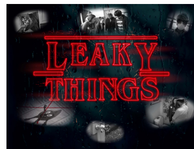
“Leaky Things” parody video.

Durham Water Management’s toilet rebate program incentivized customers to purchase nearly 900 toilets in 2020! In January, Durham encouraged the local ABC-TV affiliate to run a story about its WaterSense toilet rebate program highlighting the savings that WaterSense toilets can achieve. The department continued to work with Waste Reduction Partners to offer water auditing services to larger non-residential customers throughout the year. Durham focused its efforts on hotels, and Waste Reduction Partners was able to qualify two hotels for WaterSense labeled toilet rebates through this program. The City also completed 75 residential and commercial water use assessments before the pandemic, and in the process, provided 85 WaterSense labeled showerheads and 94 aerators to customers. In lieu of in-person water use assessments, nearly 60 phone consultations were completed during the remainder of 2020.