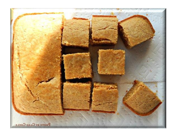
Spelt Corn Bread (Ancient Grain Quick Bread)

The answer to this culinary mystery can be found in Honey Roasted , where you'll also find this recipe.