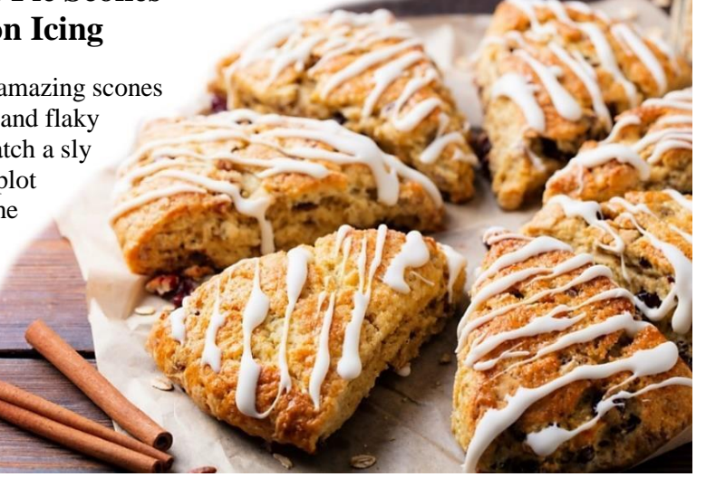
Page 2 of 9

A fabulous breakfast or coffee-break treat, these amazing scones deliver the homey flavor of apple pie in a tender and flaky wedge of iced pasty. Clare and Madame ate to catch a sly them with lip-smacking joy while hatching their plot fox. A special ingredient in the recipe is one of the secrets to their tenderness. Be sure to follow the recipe directions, especially the tip on keeping the ingredients cold as you work because the cold scones in your hot oven is a key to flaky success. Find all the steps, tips, and ingredients for this recipe in Cleo Coyle's 19<sup>th</sup> Coffeehouse Mystery Honey Roasted .