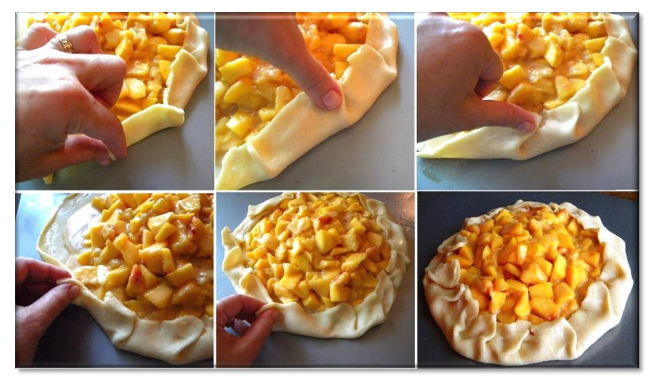
Step by Step: (1) Make and place the filling in the center of the crust. (2) Brush the crust border with egg wash. (3) Gently lift up the crust boarder and pinch the dough together, every inch, all around the crust. (4) Fold the pinches down snugly around the filling & bake!