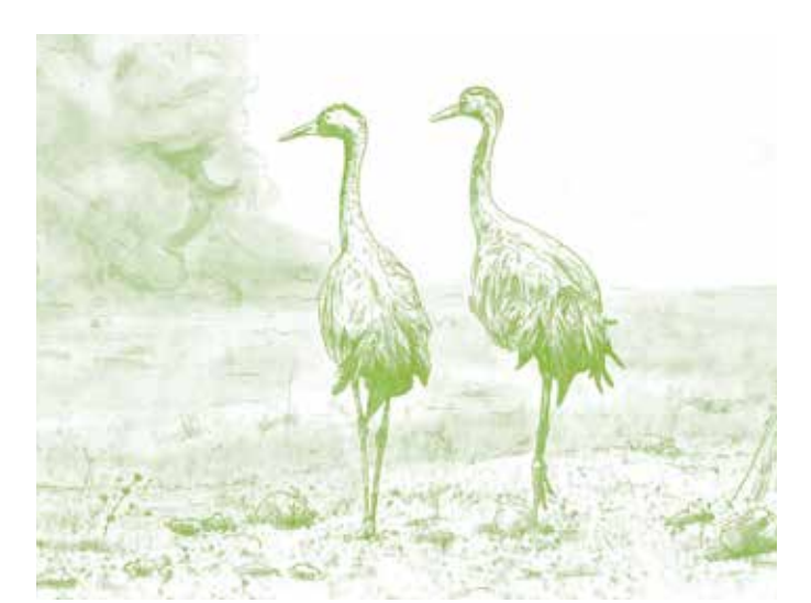
Crane ( Grus grus ). Welcome to one of the few spots in the country where the cranes are regularly sighted during their wintering period, from early November to late February.

This is a linear walking path that follows the border very closely, at one of the easternmost points of the Portuguese territory. This path begins next to the church of the Sanctuary of N. Sr.<sup>a</sup> da Enxara, on the left bank of Xévora River.