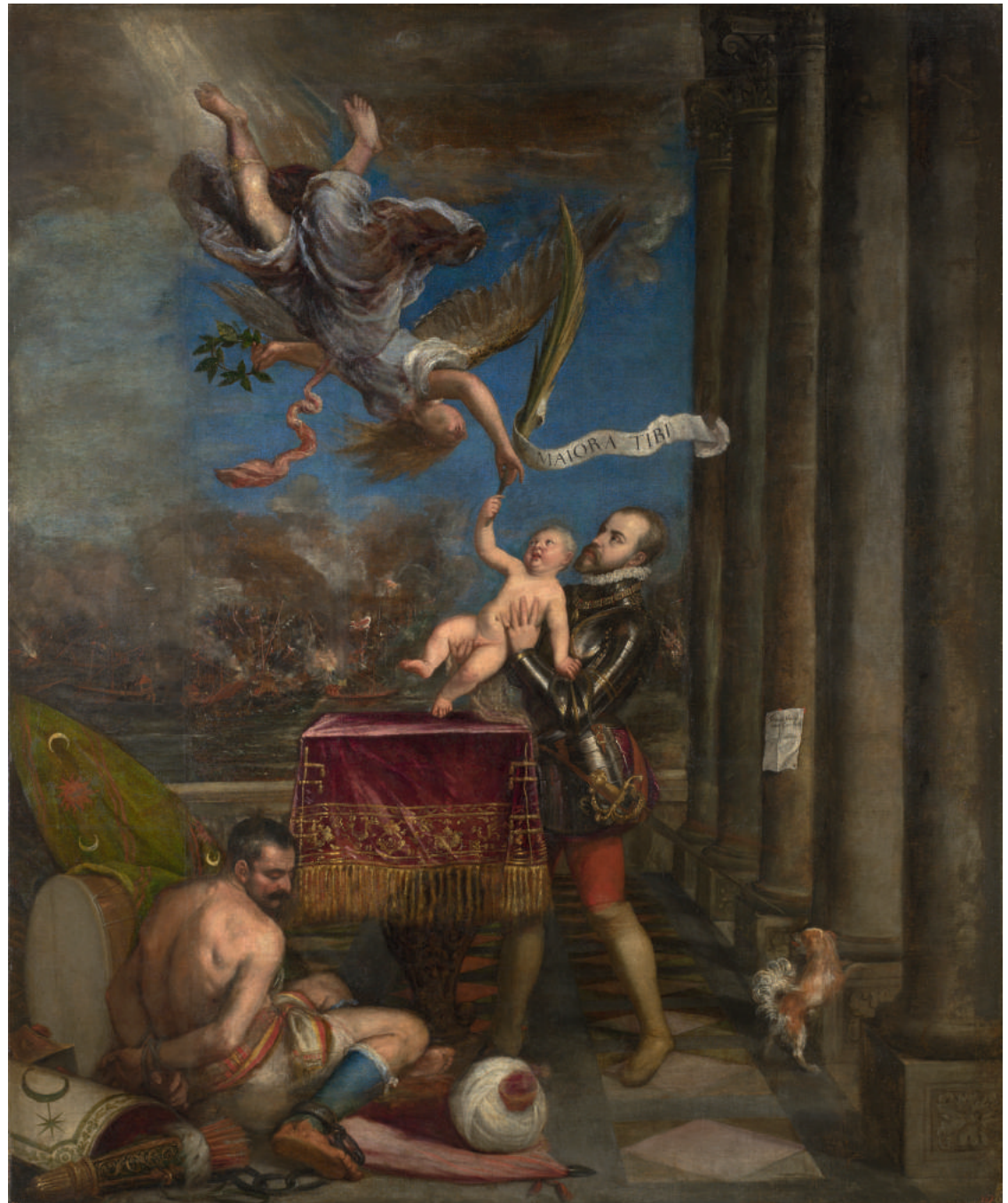
Fig. 3: Tiziano Vecellio di Gregorio, Philip II Offering the Infante Don Fernando to Victory , c. 1573–75, oil on canvas, 335 x 274 cm, enlarged in 1625 by Vicente Carducho. Madrid, Museo Nacional del Prado, P431

Orso has shown in documented detail, the iconographic program for the hang evolved continuously over several decades, but one feature of it seemed to be established from the beginning: the representation of the monarchy as Defender of the Faith. To this end, sometime in 1624–25 three masterpieces by Titian were transferred from the country palace of El Pardo back to the Alcázar, expressly to be hung in this room. 6 These included the great equestrian portrait Charles V at Mühlberg , in which the emperor is shown as the defender of orthodox Catholicism against Protestant heresy, and the allegorical portrait Philip II Offering the Infante Don Fernando to Victory (fig. 3) in which the king and his heir at the time, the Infante Don Fernando, are celebrated as the saviours of Christianity from the threat of Islam. Philip II himself had paired these two works together in the Casa del Tesoro of the Alcázar prior to his death in 1598, when they were valued more highly than any other pictures in his