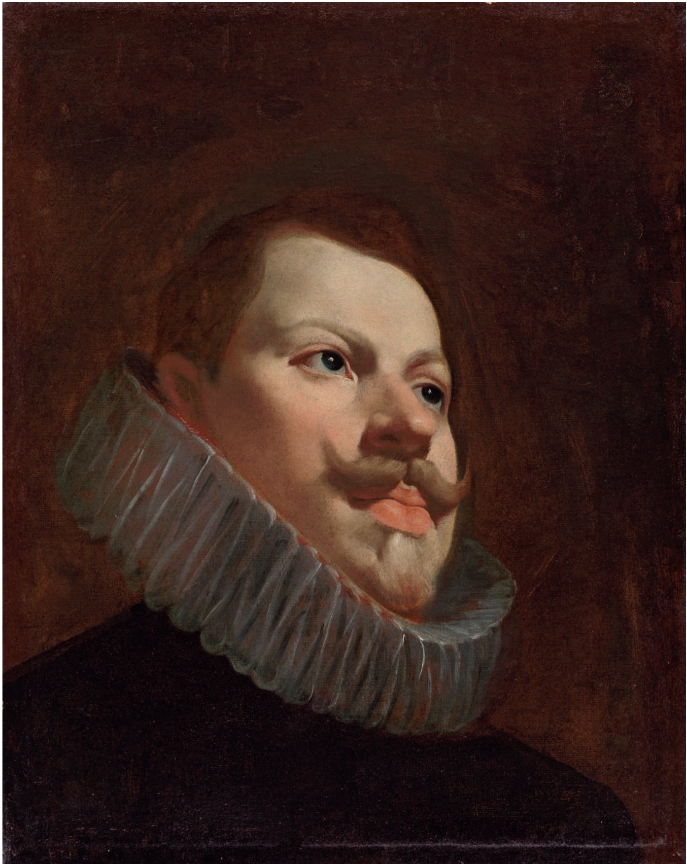
Fig. 1: Diego Velázquez, Philip III , 1627, oil on canvas, 45.9 x 37 cm.