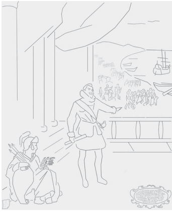
Fig. 2: Schematic reconstruction of Velázquez's Expulsion of the Moriscos