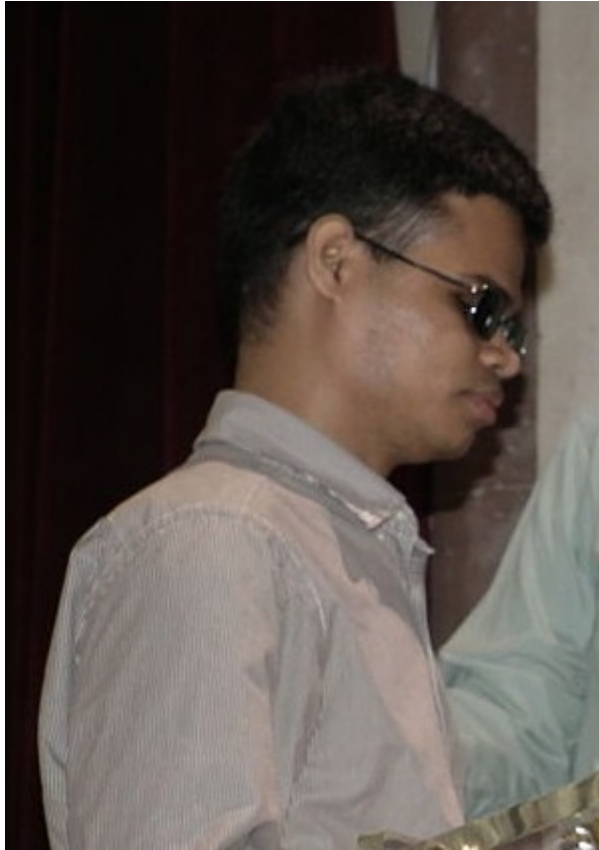
Picture cropped further.

For his contributions to Hindi Wikipedia since the last 2 years (since 2009) as the 8 th most active contributor. He has been an inspiring example to demonstrate that being visually impaired is not a hinderance to contribute over 6,717 article edits and 1,803 other edts. Infact other editors were unaware of his condition till he disclosed it in the Wiki conference.