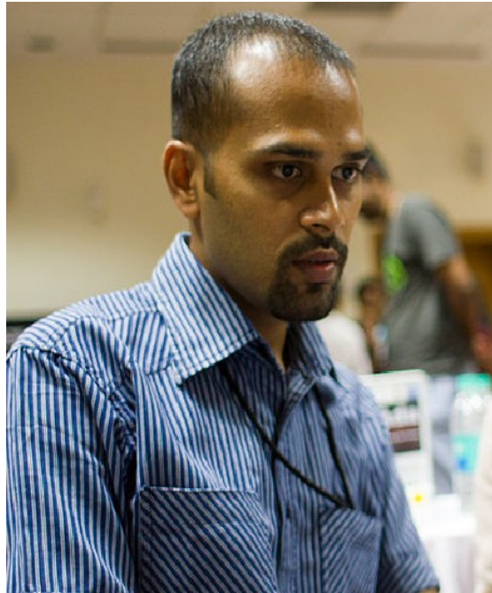
Picture cropped further.