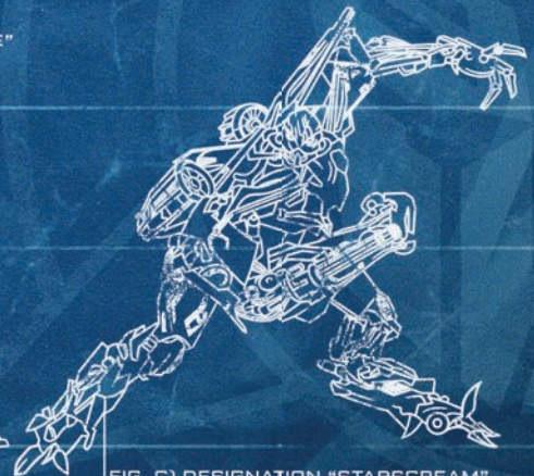
FIG. C) DESIGNATION "STARSCREAM" /DECEPTICON GENERAL /AIR-TO-GROUND MENACE