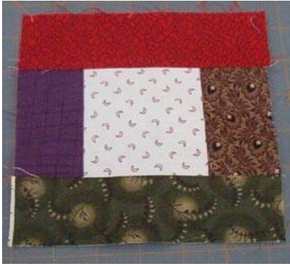
Center square surrounded.