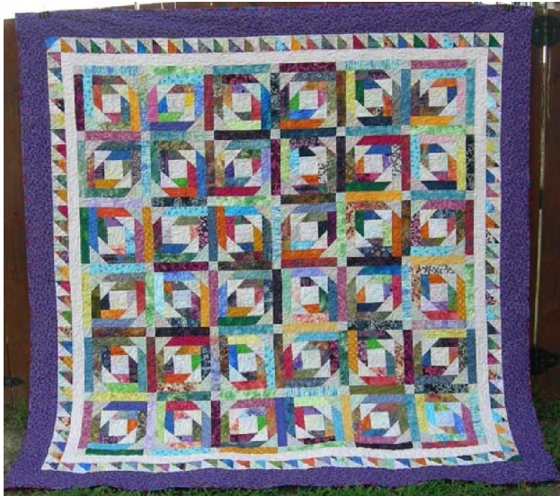
This full-sized coverlet measures 78.5"X78.5" and uses 36 pineapple blossom blocks set with sashing!

More fun with 2" strips and 3.5" squares!