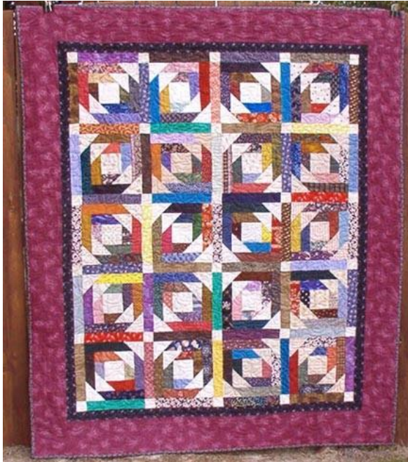
Lap Quilt size approx. 57.5"X 68" and uses 20 blocks set with sashing!

This quilt started as a pile of UFO orphan blocks! I had played with this idea (without sashings) for a while and had a good stack of blocks started. I was thinking I was going to make this into a bed sized (meaning queen or larger!) quilt...only to get side tracked by another project that came along. So here these blocks sat!