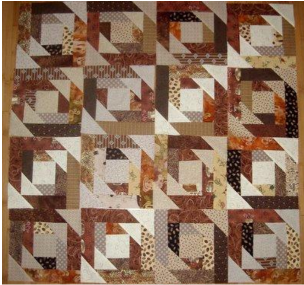
Straight Furrows, no sashing.

Two layouts sent by Sarah! I love the color coordinated yet still scrappy look. Brings the warmth of a good cup of coffee, tea, or hot cocoa to mind! I do like how it looks without the sashings too.