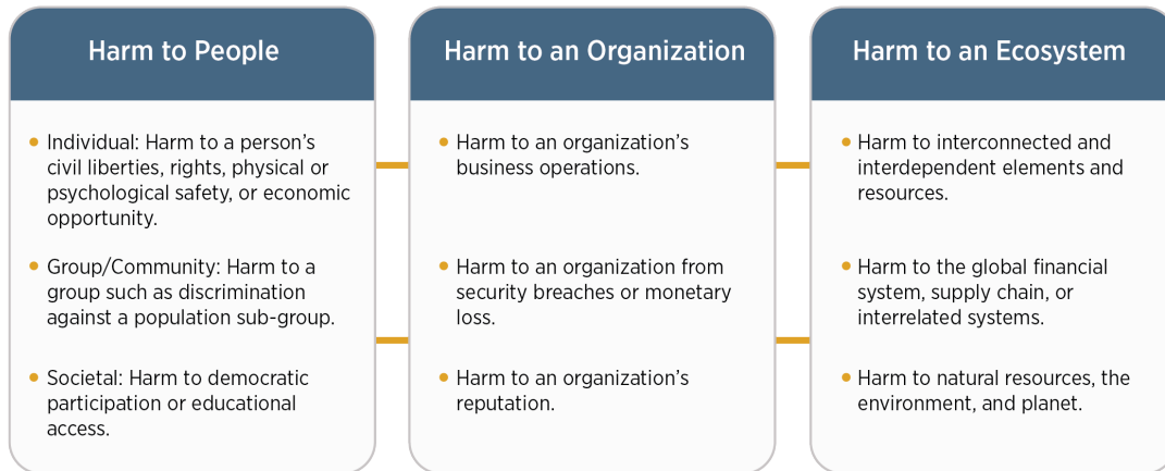
Fig. 1. Examples of potential harms related to AI systems. Trustworthy AI systems and their responsible use can mitigate negative risks and contribute to benefits for people, organizations, and ecosystems.