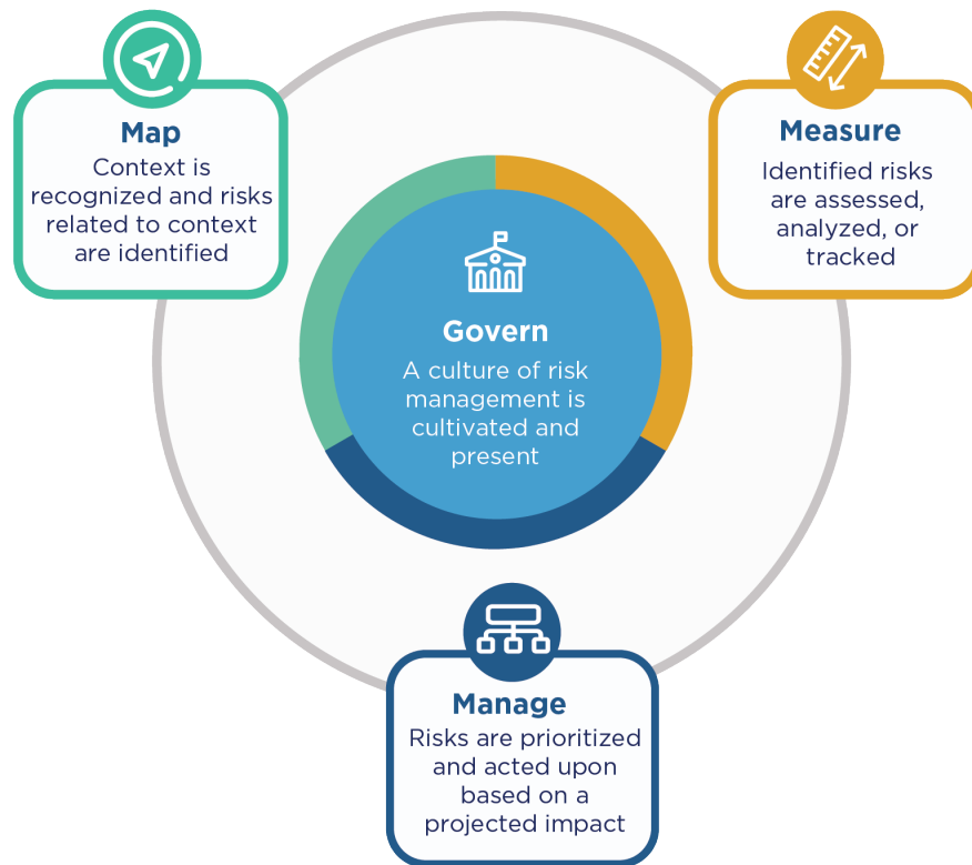
Fig. 5. Functions organize AI risk management activities at their highest level to govern, map, measure, and manage AI risks. Governance is designed to be a cross-cutting function to inform and be infused throughout the other three functions.

The AI RMF Core provides outcomes and actions that enable dialogue, understanding, and activities to manage AI risks and responsibly develop trustworthy AI systems. As illustrated in Figure 5, the Core is composed of four functions: GOVERN , MAP , MEASURE , and MANAGE . Each of these high-level functions is broken down into categories and sub-categories. Categories and subcategories are subdivided into specific actions and outcomes. Actions do not constitute a checklist, nor are they necessarily an ordered set of steps.