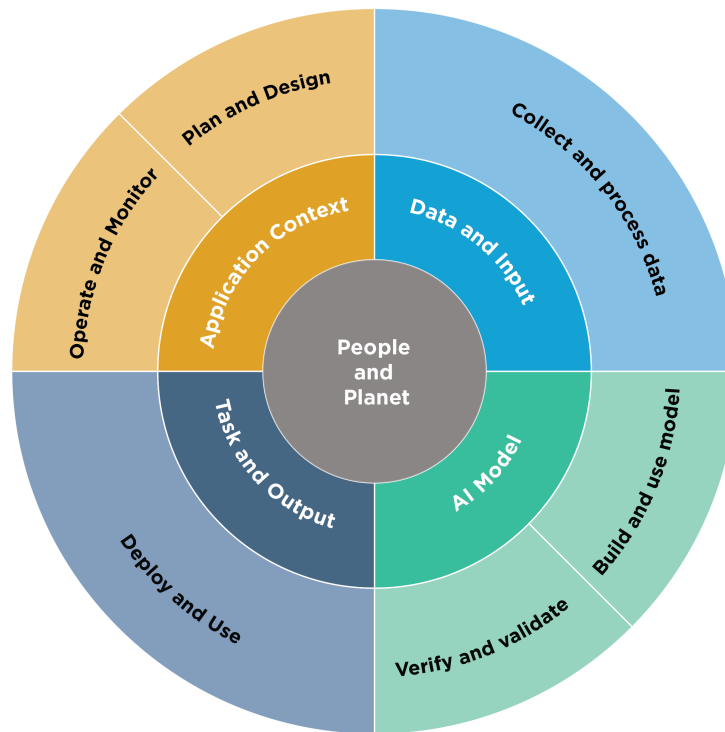
Fig. 2. Lifecycle and Key Dimensions of an AI System. Modified from OECD (2022) OECD Framework for the Classification of AI systems — OECD Digital Economy Papers . The two inner circles show AI systems’ key dimensions and the outer circle shows AI lifecycle stages. Ideally, risk management efforts start with the Plan and Design function in the application context and are performed throughout the AI system lifecycle. See Figure 3 for representative AI actors.

environmental groups, civil society organizations, end users, and potentially impacted individuals and communities. These actors can: