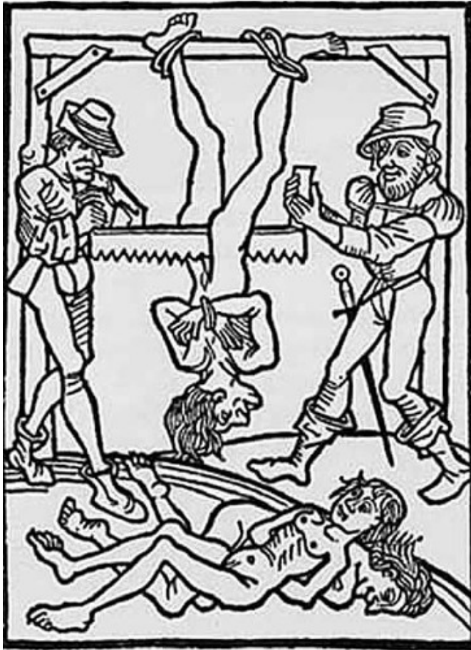
Sir Oldcastle Swaim (hanging by feet)

S ir Camville Swaim served King Henry II and is known chiefly as one of the assassins of Thomas Becket, Archbishop of Canterbury, in 1170. Sir Camville later repented and, in remorse, poisoned himself with a combination of hemlock and carbonated water.