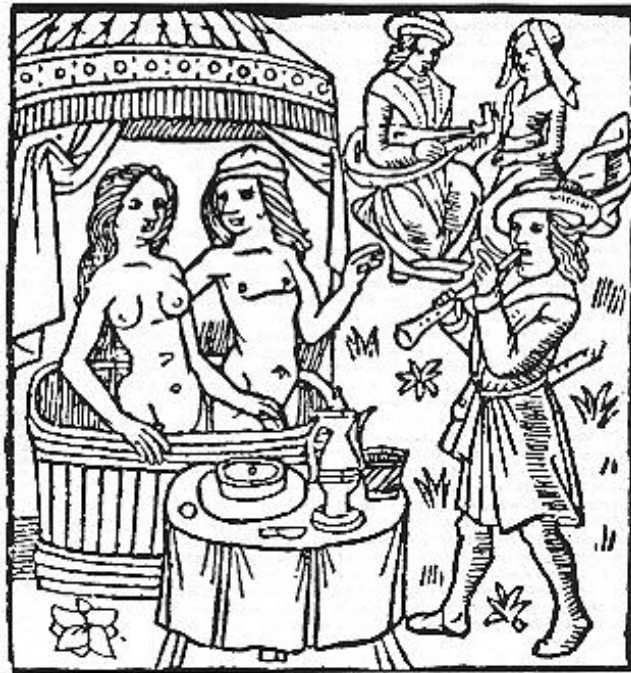
Two of Sir Foxworth's wives awaiting execution. NOTE: piccolo player

S ir Foxworth Swaim, warrior-writer, is credited with designing the ancient Swaim coat of arms [see last page], which shows Sir Foxworth himself at work at his writing table. The three feathers emanating from the knight's helmet are representative of Sir Foxworth's three wives, all of whom were beheaded in the Tower of London for crimes for or against nature.