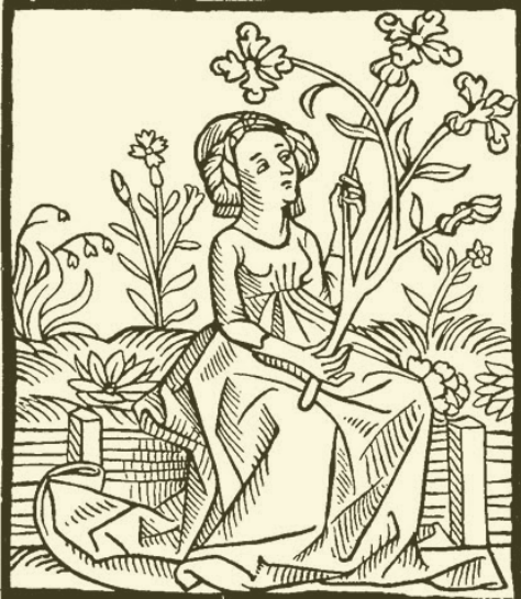
St. Etheidreda (see Sir Scrope Swaim)