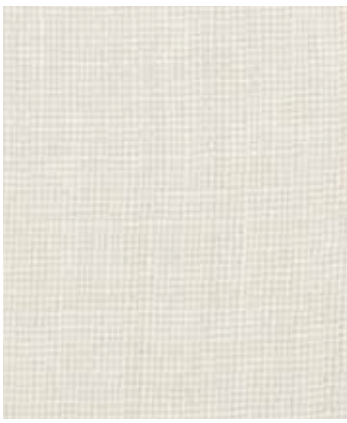
Workspace Linen - Ivory