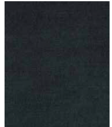
Westford - Indigo