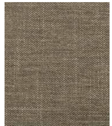
Granulated - Pewter