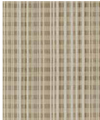
Resource Velvet - Sand