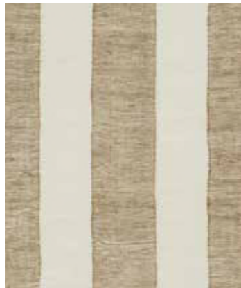
No Frills- Honey