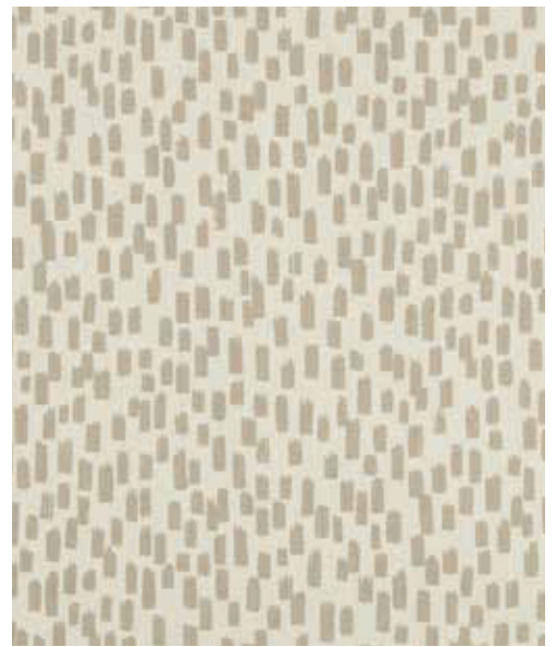
Inkstrokes - Sand