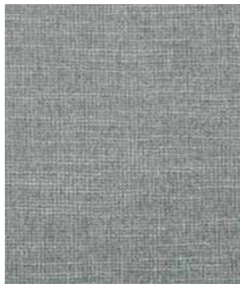
Adaptable - Chambray