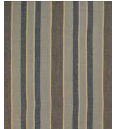
Bondi Stripe - Denim