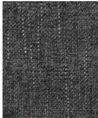
Unstructured - Admiral