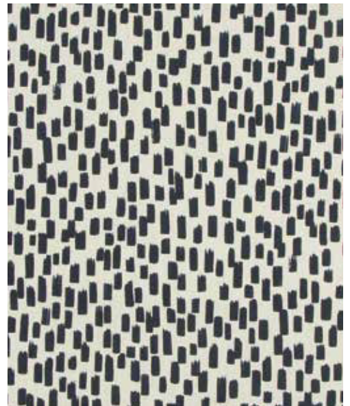
Inkstrokes - Admiral