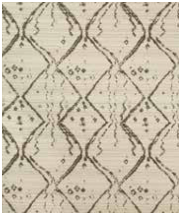
Globe Trot - Stone