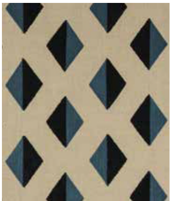
Barroco Boucle - Denim