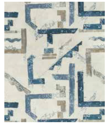
Dessau - Chambray