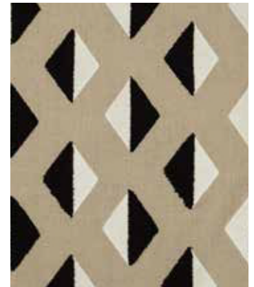
Barroco Boucle - Dalmatian