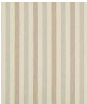
Bowline - Quartz