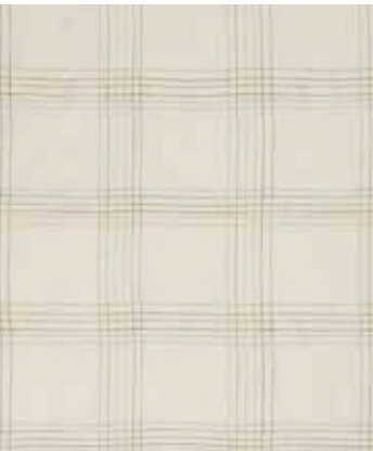
Tied and True - Beach