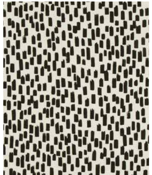
Inkstrokes - Nero