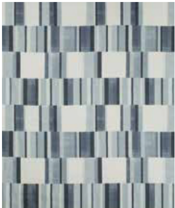
Blockstack - Chambray