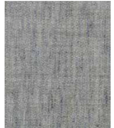
Amalgam Linen - Denim