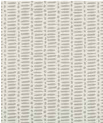
Dash Off - Quartz