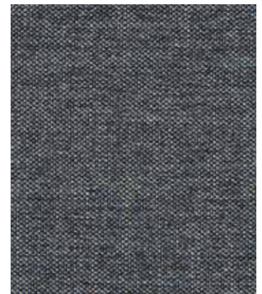
Granulated - Denim