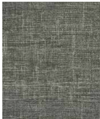
Assemblage - Atmosphere