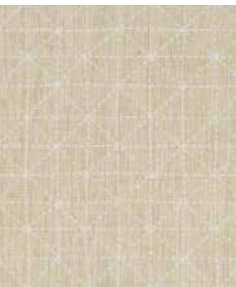
Appointed - Papyrus