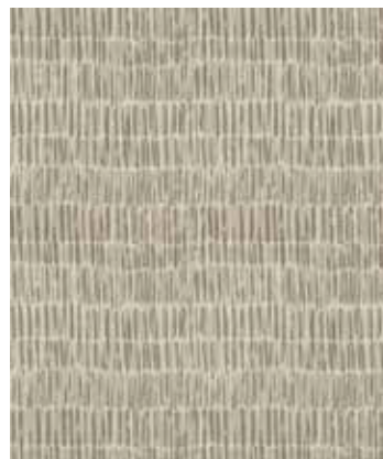
Perforation - Storm