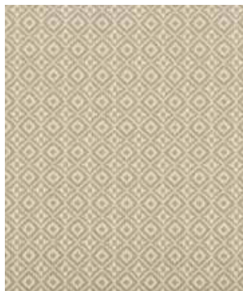
Attribute Grid - Papyrus