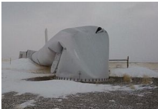
Wind Tower destroyed by Wind in Windy Wyoming