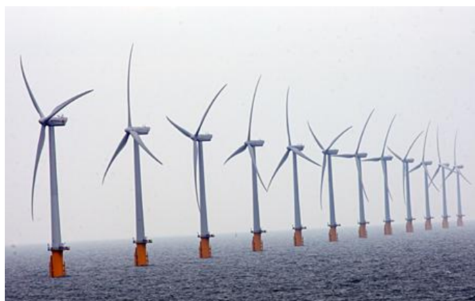
Thanet Wind Farm off the coast of Kent.

"Every time we were building onshore, the public reacts in a negative way and we had a lot of criticism from neighbours," said a spokesman for the government owned wind company. "Now we are putting all our efforts into offshore wind farms."