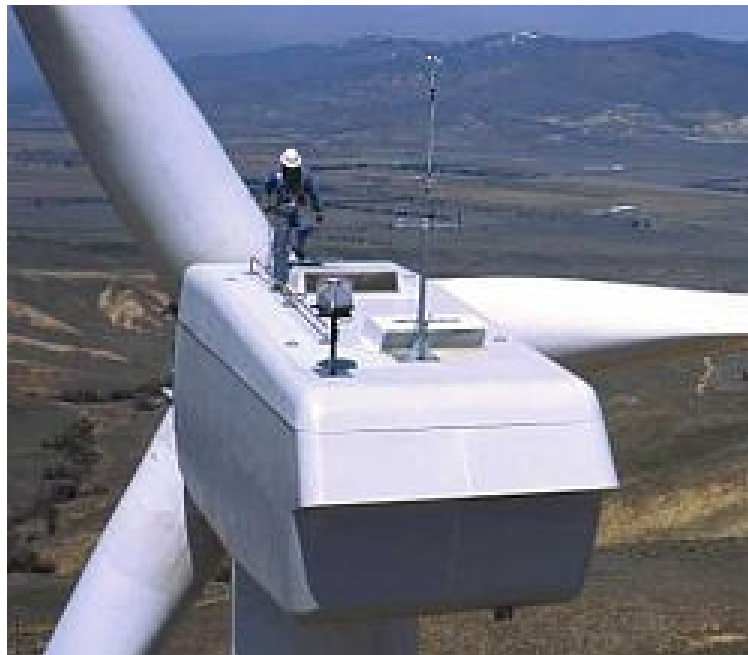
Not just a Friendly Farm Windmill.

Wind towers are a danger to workmen forced to work on small platforms at great heights sometimes in high winds.