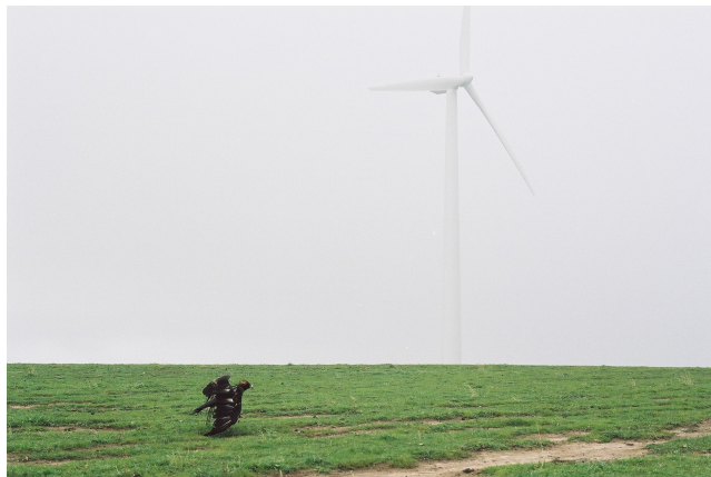
Wedge tail Eagle Maimed, Starfish Hill, Australia.

Source and more info on Eagle kills in Australia: http://www.iberica2000.org/Es/Articulo.asp?id=4382