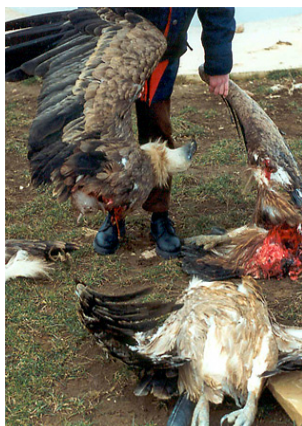
Sliced Griffon Vultures, Navarre, Spain.

Similar battles over bird kills were reported in Ireland and Scotland.